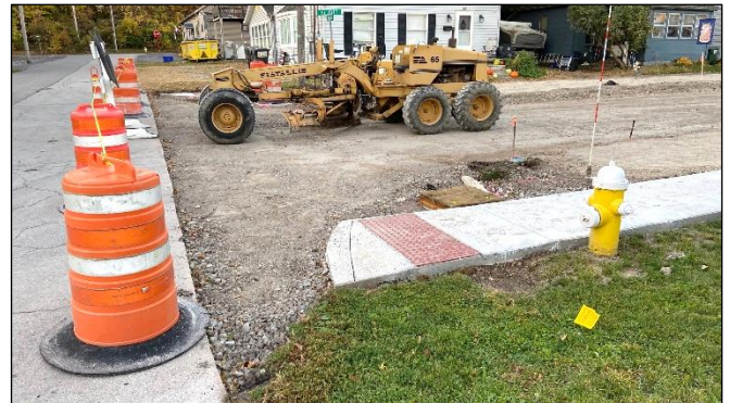
Elliott/Perry intersection, 10/24/22