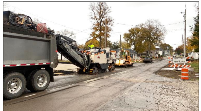
Milling the Elliott St pavement between Gilbert St and Stone St, 10/26/22

Collection of leaves and yard waste by the Village maintenance crew has increased significantly as is usual during the autumn.