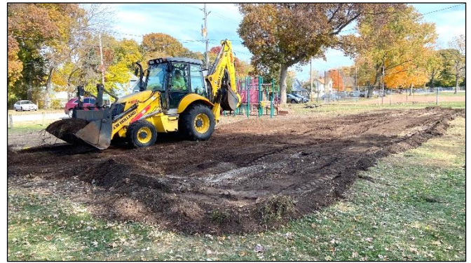
Playground site grading by Bryan and Tom, 10/25/22

Elliott Street Project: The contractor anticipates street paving will be completed by the end of the week of Oct 24, and follow-up field work completed the following week. The contractor intends to submit just one invoice to the Village at the end of the project.