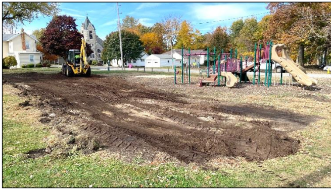
Playground site grading by Bryan and Tom, 10/25/22