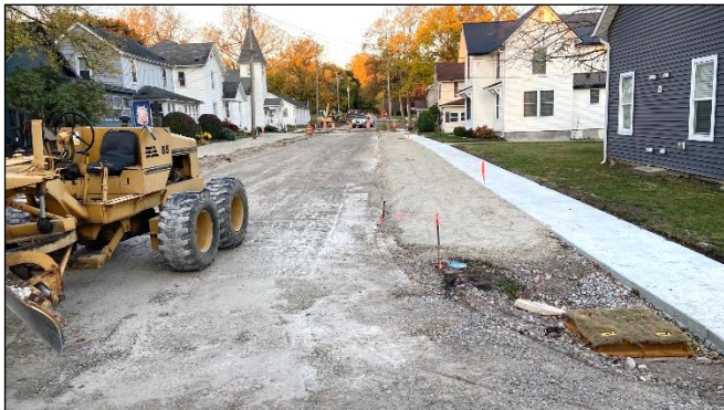
Looking west from Perry St, 10/24/22

Elliott Street Project: The contractor anticipates street paving will be completed by the end of the week of Oct 24, and follow-up field work completed the following week. The contractor intends to submit just one invoice to the Village at the end of the project.