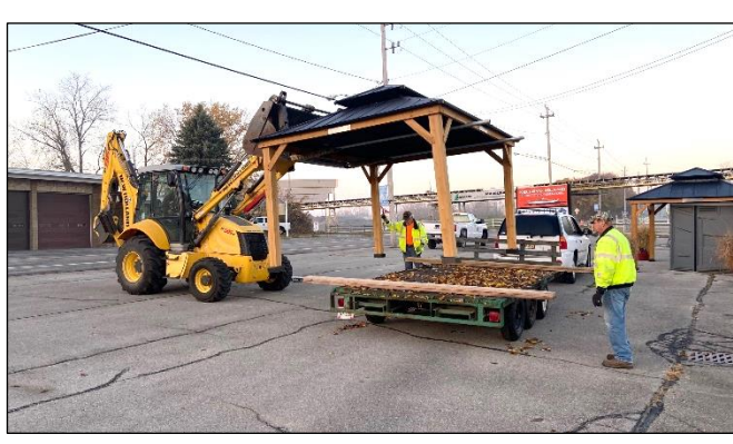
Loading the picnic shelter onto a trailer