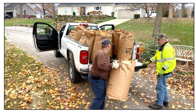
Village crew picking up leaves, Nov 2022