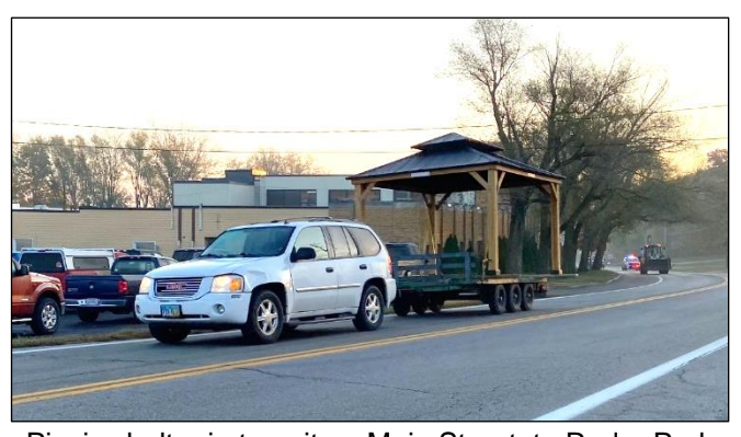
Picnic shelter in transit on Main Street, to Radar Park