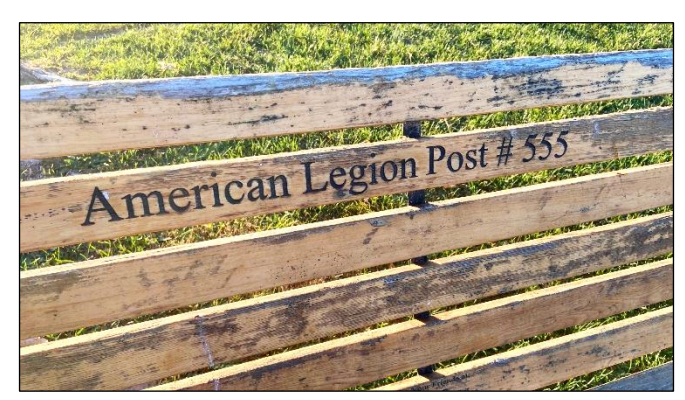
Bench, American Legion Post 555