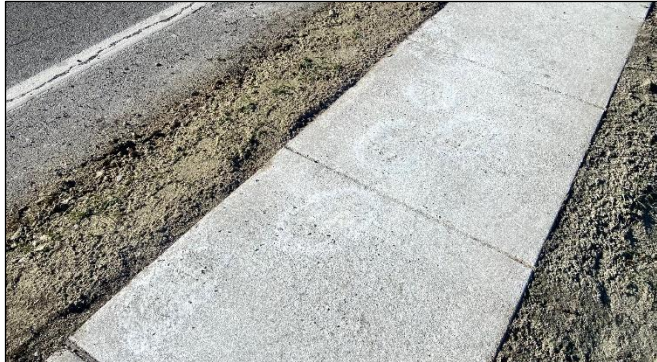
The footprints filled