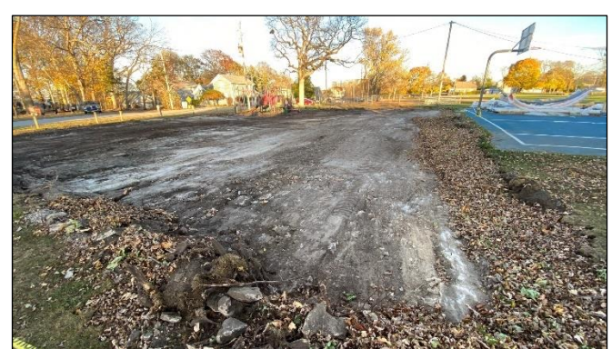
Playground site graded by the Village crew as of 11/8/22

Marblehead Welcome Center Project: The design plans need to be reviewed and approved by the National Park Service (NPS). I am awaiting a return call from the NPS's project manager for a status update. Funding for this project includes $15,000 through the Ottawa County Park District's 2022 Parks & Trails Improvement Grant program. To receive those funds, the Village must first submit its final project completion report to the Park District by July 1, 2023.