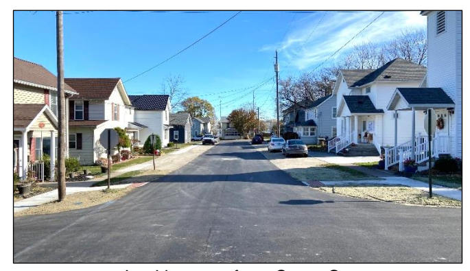
Looking east from Gilbert St.