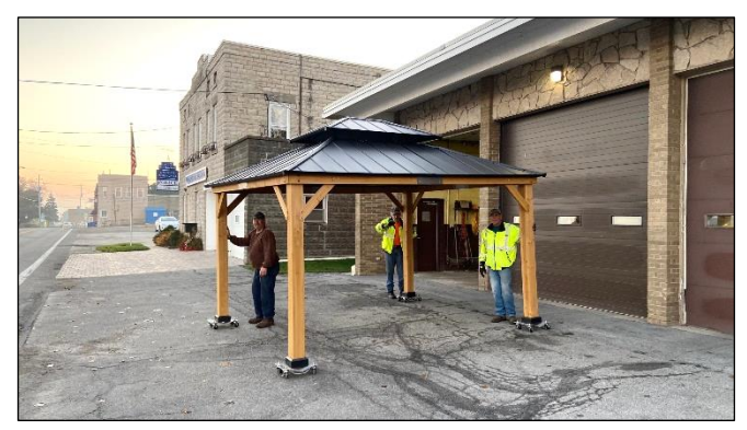
Picnic shelter being rolled out of the shop

Picnic Shelters at Radar Park: The Village crew completed the assembly and installation of a second picnic shelter for Radar Park, on 11/2. One more shelter remains to be completed.