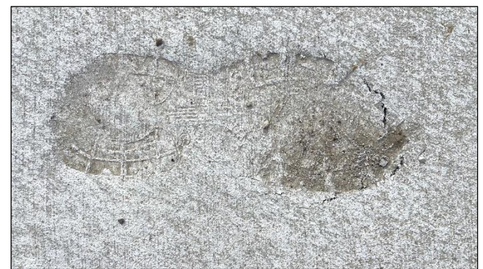
Footprints on the recently poured concrete