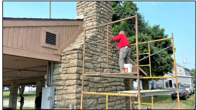
Mildew removed and mortar being repaired (6/8/23)

Marblehead Welcome Center Project: Before we conduct a public meeting, I have contacted the National Park Service asking for their concurrence with the Village's current intention to simplify the scope of this project to make the Radar Park building into a community meeting space with restrooms (which is consistent with what the originally approved proposal was in 1971).