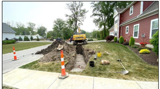
Installing the 8-inch watermain loop to link the existing dead-ends