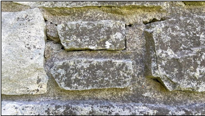
Gaps in mortar, mildew on limestone, before repairs

Masonry Construction Co., Inc. completed masonry repairs to the James Park picnic shelter for $2,430. This is $510 less than the original quote because less labor was required than had been anticipated. The project included the columns, fireplace, and chimney. Mold killer was applied about two weeks ahead of the surfaces being washed, mortar tuckpointed, and two coats of a masonry sealer applied.