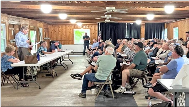
Village representatives addressing the audience

Johnson's Island Waterline Project: The project task group met on 6/21 and the Village conducted a public information meeting on 6/24. Village representatives presented the latest information about the project's scope, schedule, and budget, addressed questions from the audience, and property owners discussed the preliminary design drawings with the project engineers. The timeline for completion of the environmental review process and regulatory permits is not yet known, although the waterway permit application has been submitted to the US Army Corps of Engineers, and Phase I archeological survey will start soon. Special legal counsel will be hired specifically to guide us through the ORC 727 Special Assessments process. A page has been created on the Village website about the project.