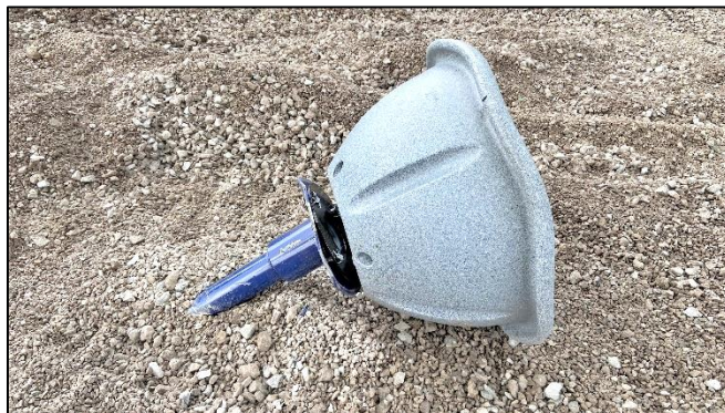
Tilted spinner seat damaged during turf installation