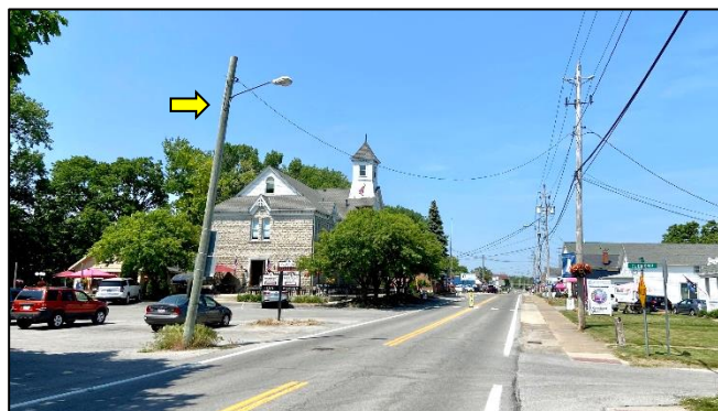
Looking west toward the Main/Clemons intersection

Utility pole at Main/Clemons intersection: Pursuant to the Infrastructure Committee's recommendation for removing the utility pole and streetlight at the Main/Clemons intersection, I have contacted First Energy Corp. who owns the pole, and am awaiting their price estimate for the project.