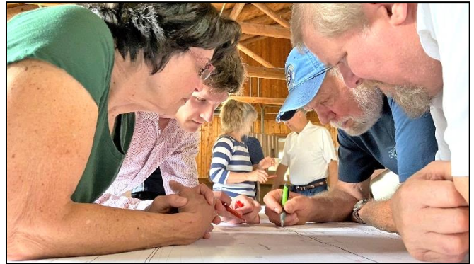
Property owners reviewing plan details with an engineer

Bay Point Water Meters: The 8-inch watermain loop to link the existing dead-ends has been completed. The work remaining to be completed includes installing a pit and meter at the Office, installing the valve and meter vault at the Campground, and then relocating the 6-inch meter to the Campground.