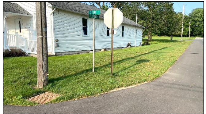
Stabilized site conditions, July 2023

Elliott Street Drainage: The concerns about the street runoff and establishment of grass growth along the frontage of 1002 Elliott St, noted in previous Administrator's reports, continue to improve and further grading adjustments are planned to help stormwater reach drainage inlets.