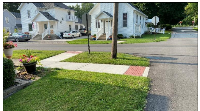
The new sidewalks in front of 922 Elliott St, July 2023