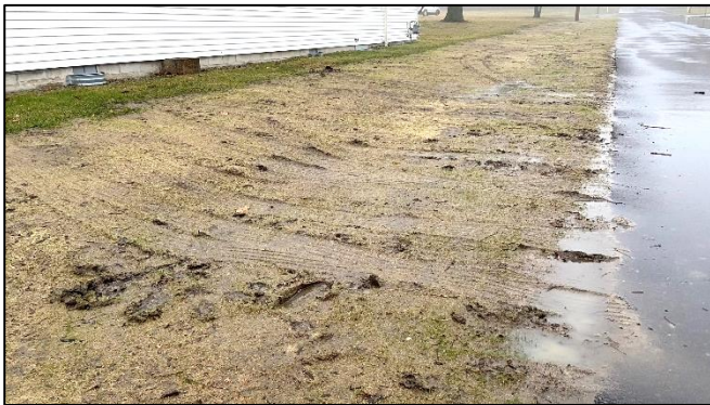
Muddy site conditions, Jan 2023

Elliott Street roadside parking: Following completion of the Elliott St improvement project in Fall 2022, it was noted that the project did not include replacing the gravel parking along the south side of Elliott St, and west of Stone St. The concern was that since this area is used for parking, it was becoming muddy and grass may not be able to become established there. Therefore, the Village has been planning to have a contractor install gravel at a cost of $7,500. However as of Summer 2023, the area of concern has become stabilized with vegetation. As such, I have cancelled the graveling project in favor of using the funds for more pressing needs.