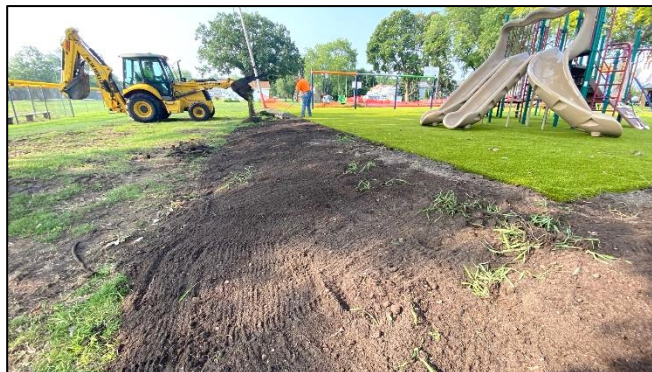
Village maintenance crew adding soil along the sides of the new playground, July 2023

James Park, Playground Renovation: Forever Lawn, Inc. will replace the tilted spinner and it's anticipated this work will occur during mid-August. I am obtaining quotes from contractors to create a retaining wall where needed, and quotes for removing the silver maple. Meanwhile, the village crew will be bringing in soil, grading, and sowing grass seed along the sides of the playground where it is higher than the existing ground surface.