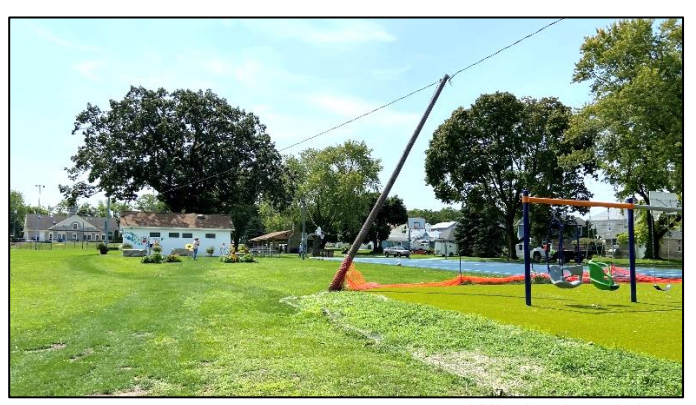
Wind-related damage at James Park