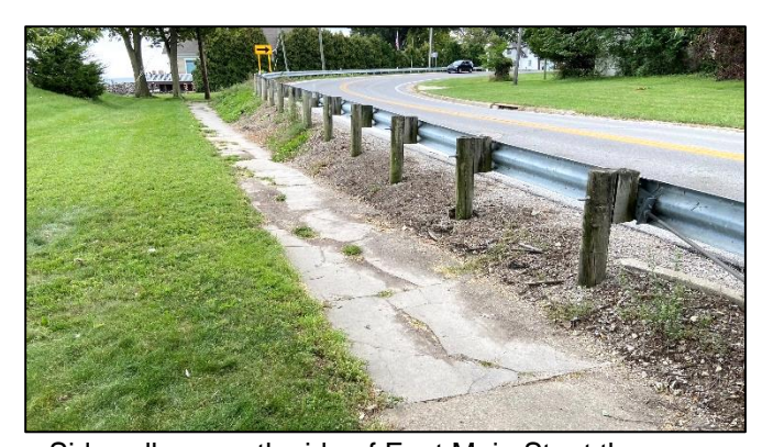
Sidewalk on north side of East Main St, at the curve

I recommend proceeding with Kuzma Concrete & Construction LLC, for $22,952 to complete all the Church, Perry, and Main sidewalk locations listed here.