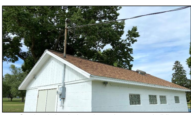
Overhead electrical service to the restroom building