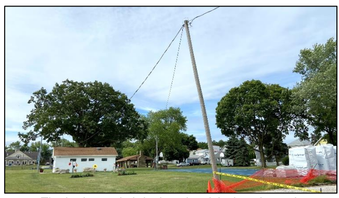
The broken pole bringing electricity into the park