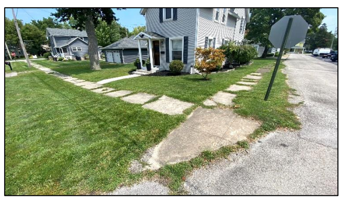
Sidewalks on Perry St, from Prairie St to Church St and on Church St, from Perry St to the first driveway