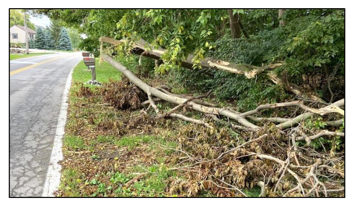
Trees and limbs fell along roads (multiple locations) and at the cemetery