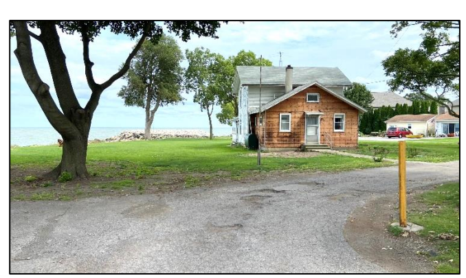
House site on 8/22/23

The house at 109 Pleasant Street was demolished the week of 9/4/23.