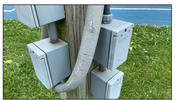
Deteriorated wiring on the auxiliary pole