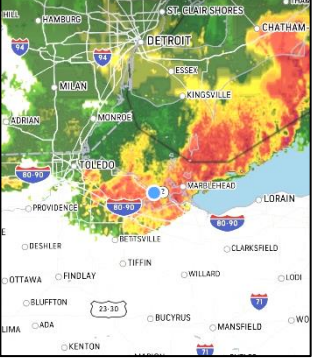
Weather radar, 8/24