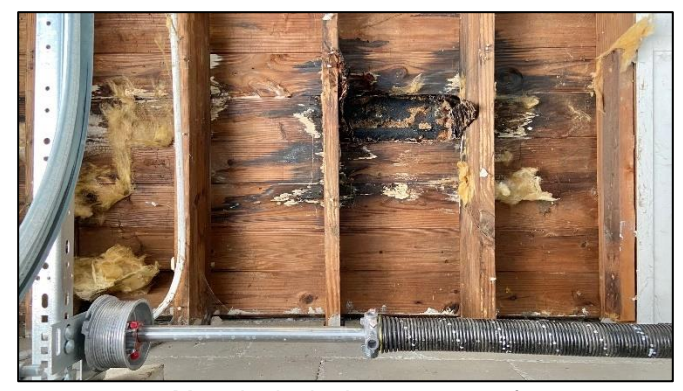
More leaks in the garage roof

The house at 109 Pleasant Street was demolished the week of 9/4/23.