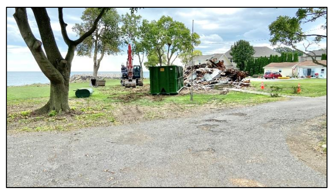
House site on 9/6/23

Omni Fiber, LLC broadband infrastructure upgrade and expansion: Nothing new to report since the Administrator's report of 7/26/2023.