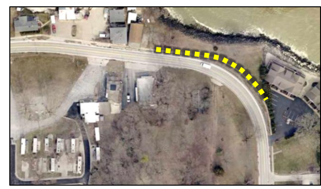
Yellow dashed line = project location