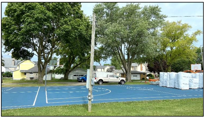
Auxiliary pole with meter, breaker panel, and outlets